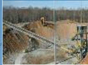
FIXED HEIGHT STACKER