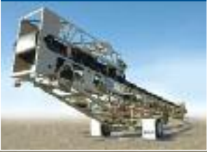
TOP-FOLD LATTICE FRAME